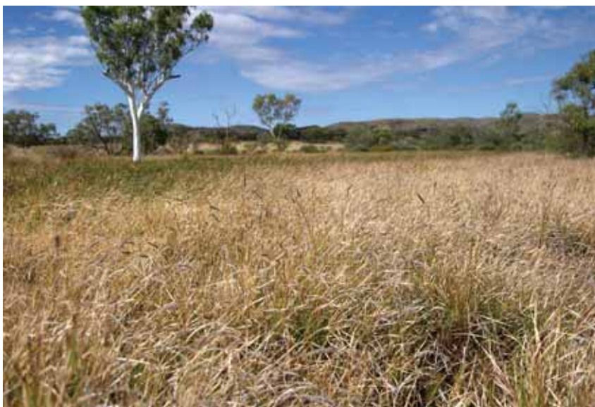
Buffel grass ( Cenchrus ciliaris ) infestation on calcareous loamy soil along a creek in Karijini NP, WA.

Buffel grass seed may survive for up to an estimated 4 years in the soil, but plants can live for many years (possibly up to about 20 years). In drier locations, moisture levels sufficient for high seed production, or for widespread germination and plant establishment, may occur infrequently. The variable climate may result in a dynamic distribution of buffel grass across the landscape, with drier sites being recolonised from moist refuges after prolonged drought.