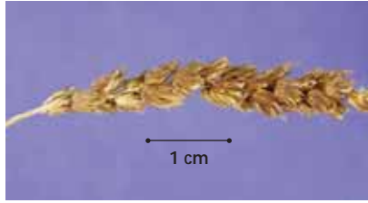
Birdwood grass ( Cenchrus setiger ) seed head lacks long, fine bristles.

Buffel grass is a long-lived tussock grass with a deep, tough root system. While some cultivars can grow up to