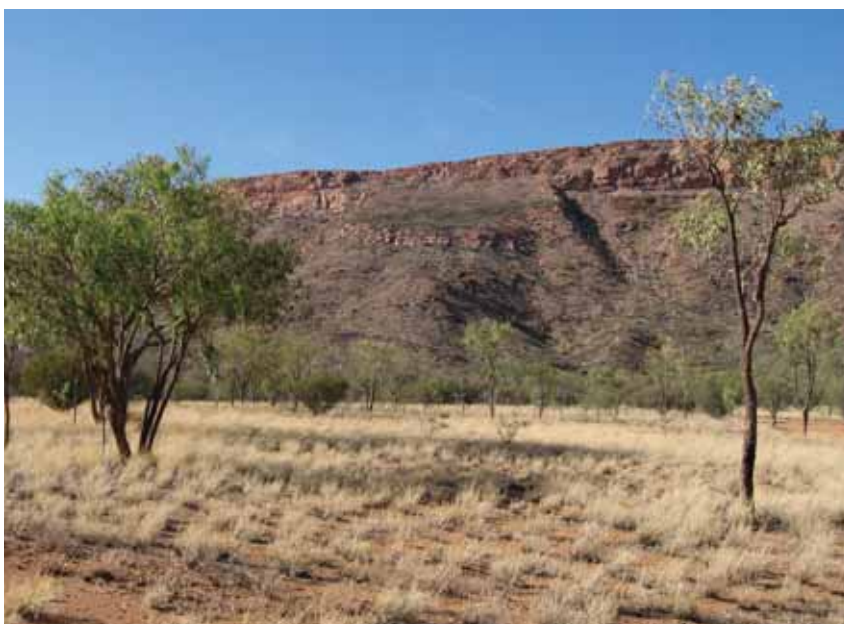
Buffel grass ( Cenchrus ciliaris ) can dominate the understorey in arid regions. Central Australia, NT.