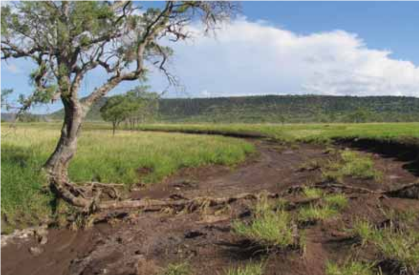
A drainage line in buffel grass ( Cenchrus ciliaris ) pasture on heavy clay alluvium near Springsure, central Queensland.