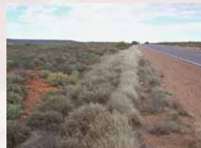
Buffel grass ( Cenchrus ciliaris ) along the highway near the Flinders Ranges, SA.

© 2008 Information which appears in this guide may be reproduced without written permission provided the source of the information is acknowledged.