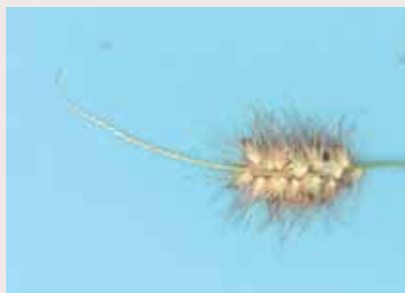
Shedding seed head, with zigzag axis.