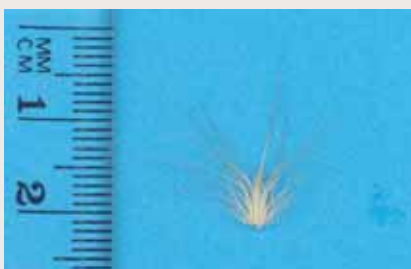
Burr.