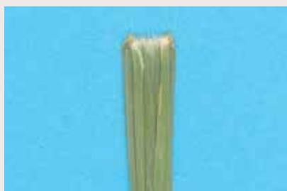
Ligule at the junction of leaf blade and sheath is a fringe of hairs, 0.2–2 mm long.