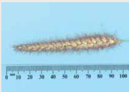
Flowering head.