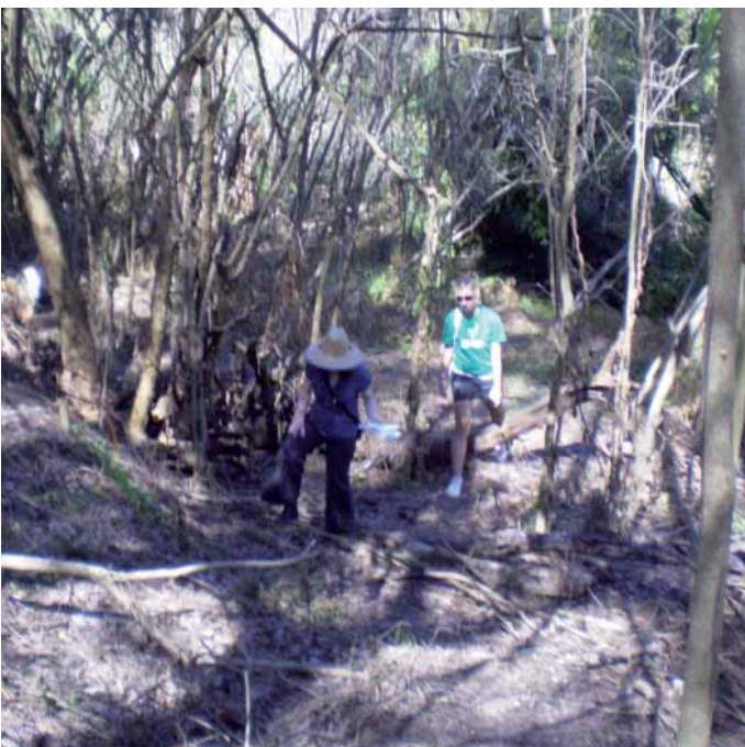
Huntington Reserve on the day of the walk—dead Privet frilled and Anredera sprayed

Small-leaved Privet covered with Balloon vine and Madeira Vine. There were also areas of Lantana, Cat's Claw Creeper and Maclura pomifera present.