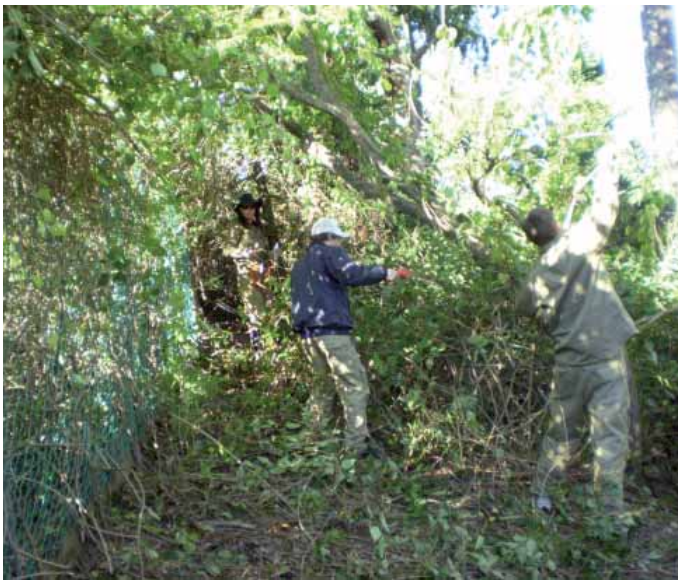
Green Corps team clearing Lantana to gain access to Huntington Reserve