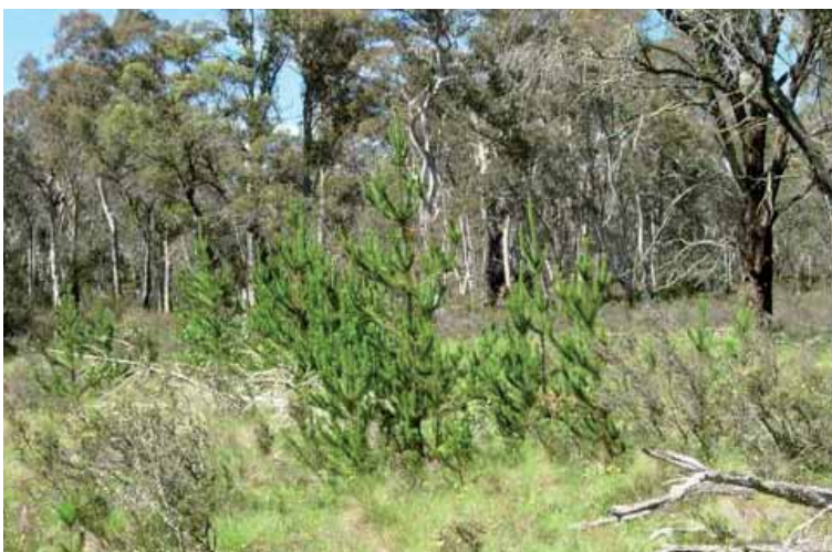
Grove of young pines of various stages at the edge of a swamp.