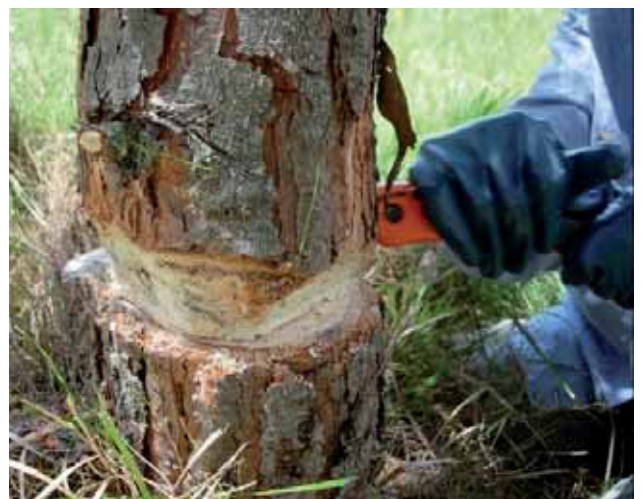
Ringbarking a pine with a folding saw - a larger bow saw would have been quicker and easier.