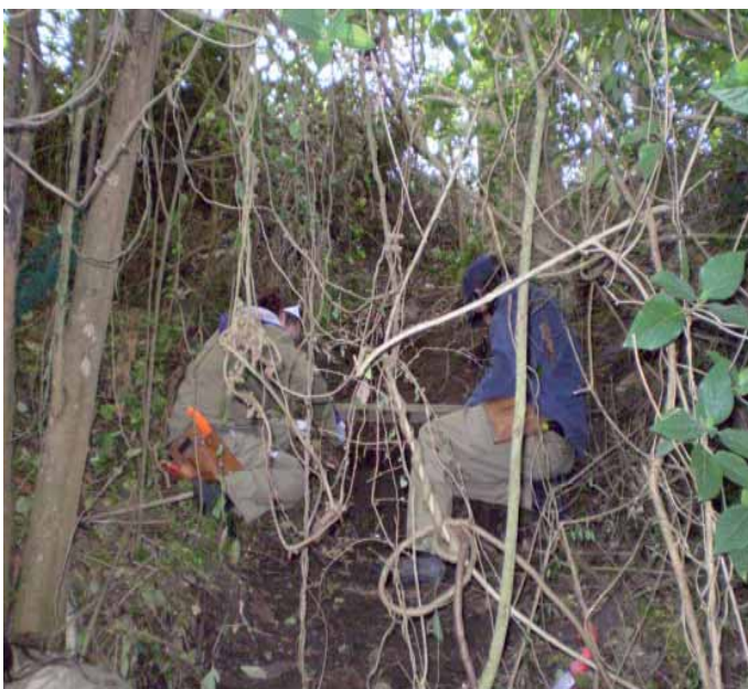
Green Corps working amongst Madeira Vine