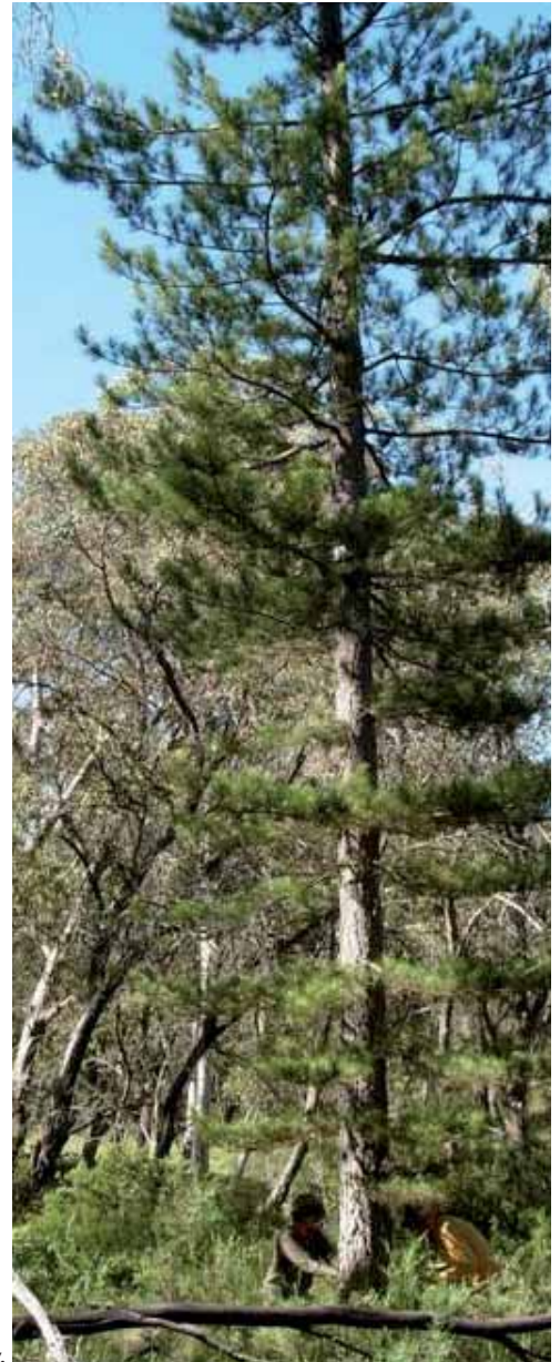
Ringbarking a very tall Pinus radiata with a bow saw.