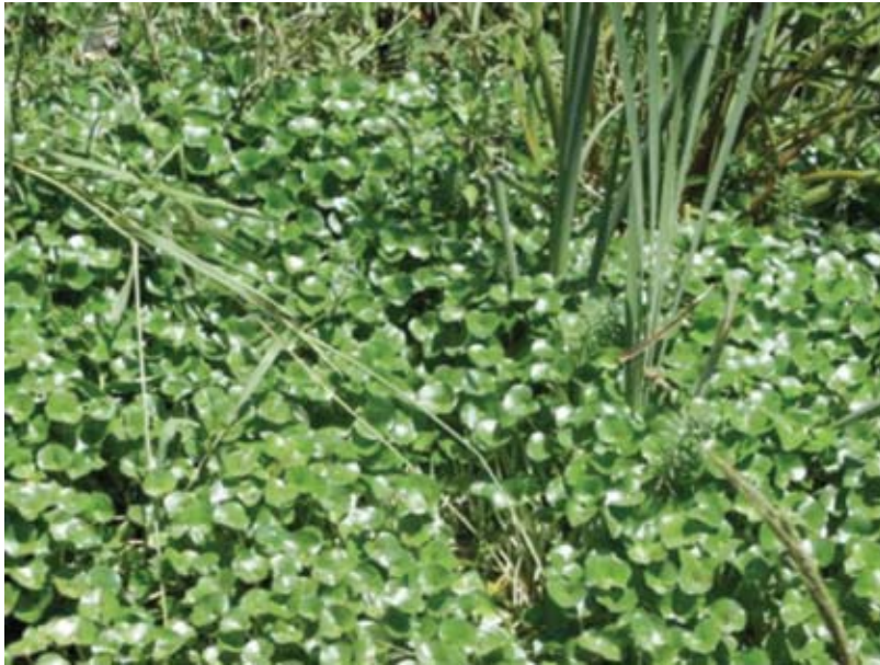
Figure 2. Growth habit of H. reniformis .