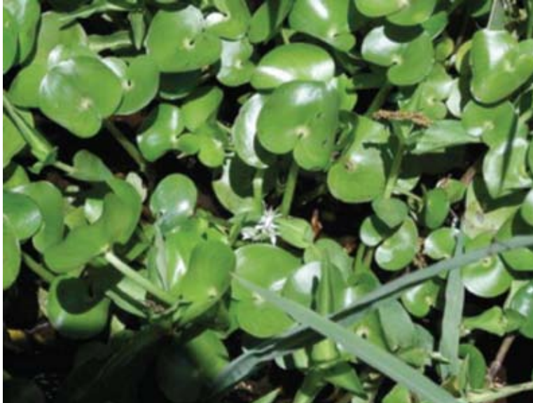
Figure 1. Leaves and flowers of H. reniformis .

H. reniformis is an annual or facultatively perennial plant, 20–50 cm tall, that grows in shallow, freshwater wetlands (Figures 1, 2 and 3). It can grow submerged or floating, with procumbent stems that either creep along the mud or float. The stems are wrapped in thick squamiform sheaths and produce roots at the nodes.