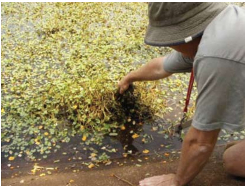
Figure 3. Mat-forming habit of H. reniformis growing in a shallow concrete drain.