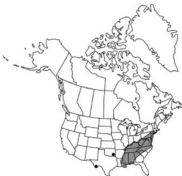
Figure 5. Native distribution of H. reniformis in North America (source: Flora of North America 2007).

Within the United States, the range of H. reniformis extends from a sinkhole area in Illinois at its north-western edge; east to New York, Delaware and Connecticut; south along the coast and to Texas where it is known from only one collection; to Mexico and Central America where it is common; and the West Indies (e.g. Puerto Rico, Jamaica), south to Paraguay and Argentina (NatureServe 2007). In the United States, it is most common near the Mississippi River in Louisiana and western Tennessee. In Kansas, Nebraska and Oklahoma, any records for H. reniformis are most likely H. multiflora (i.e. were misidentified). There are no positively identified H. reniformis specimens in these three states, nor does the species exist in Indiana (NatureServe 2007). The native distribution of H. reniformis in the United States is provided in Figure 5. It is listed as an endangered plant in Illinois and Ohio (USDA Plants database 2007).