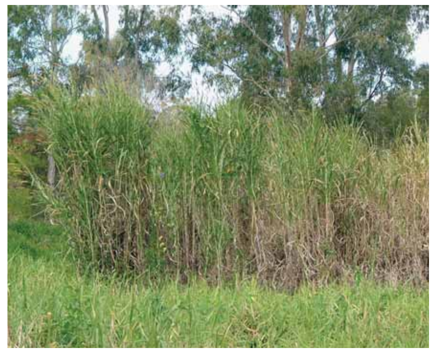
Elephant grass ( Pennisetum purpureum ) has rhizomes and can form very tall, large clumps.

desirable plant cover rather than weed seedlings and regrowth of the target species or other weeds. As well as the information presented in this guide on the biology and control of Pennisetum species, the plan needs to be based on specific knowledge about the site—including the distribution of other major weeds.