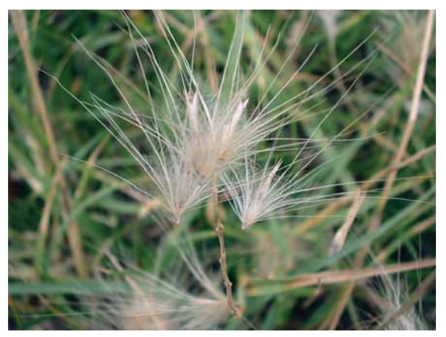
Feathertop ( Pennisetum villosum) burrs have long bristles that are feathery towards the base.