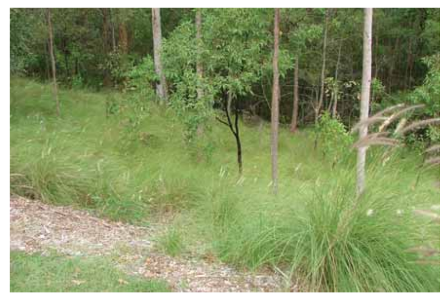
Fountain grass ( Pennisetum setaceum ) planted along a roadside has spread into adjacent bushland: Brisbane, Queensland.