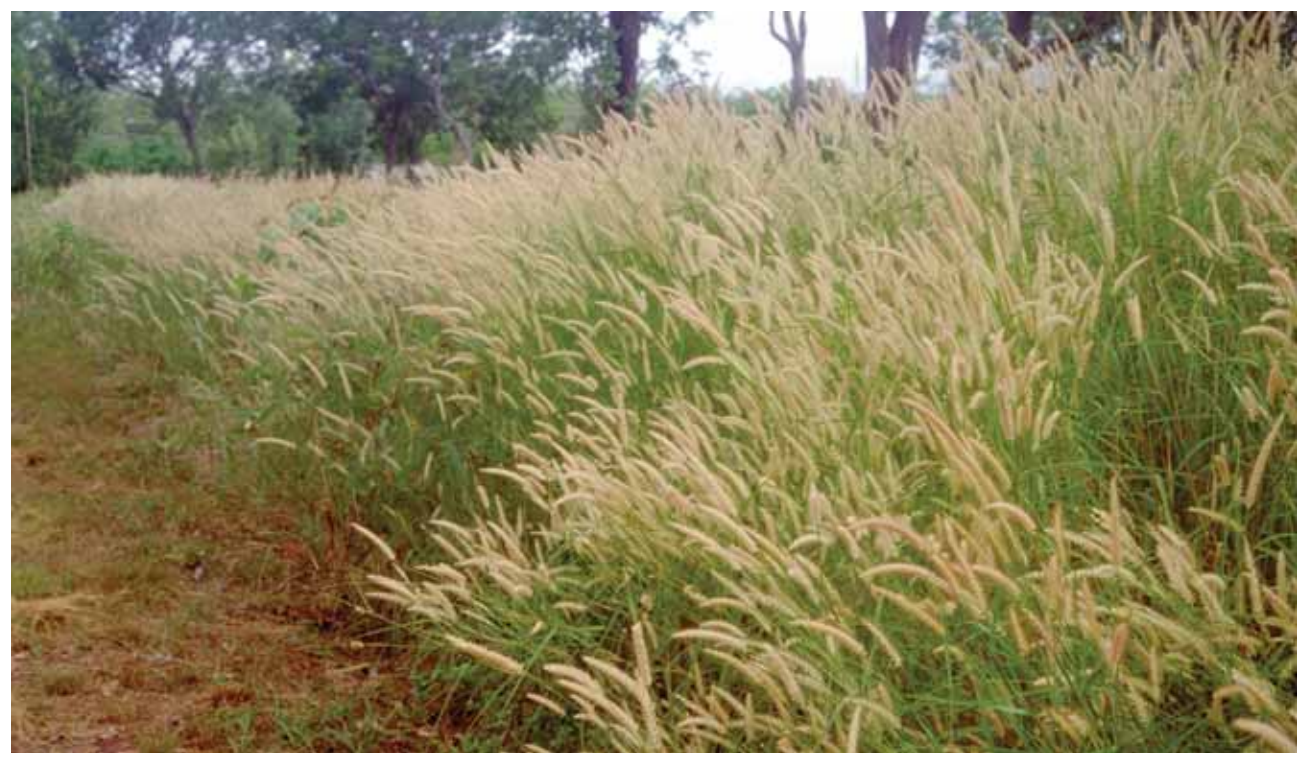
Deenanth grass ( Pennisetum pedicellatum ) infestation: Top End, NT.