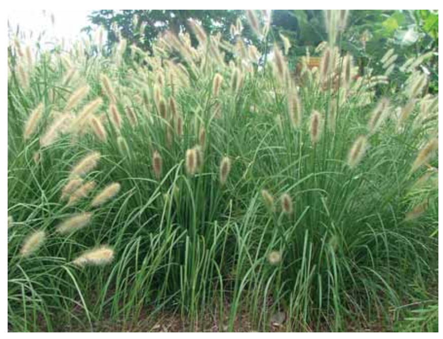
Swamp foxtail ( Pennisetum alopecuroides ) is widely planted and has become naturalised outside its native Australian range, especially in Vic. It is very similar to fountain grass ( P. setaceum ).

Generally tussock Pennisetum species are not very palatable to stock but on other continents in tropical regions young shoots of elephant grass ( P. purpureum ) are a major source of cut fodder. Deenanth grass is a pasture species in India.