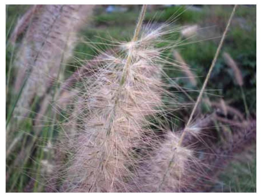
Fountain grass (Pennisetum setaceum) bristles are feathery towards the base.

making sure that all the roots are removed. This is more feasible for species that do not form rhizomes. Follow up control is essential as regrowth may occur. In the case of deenanth grass, it is essential to remove plants before seeds mature. For perennial species this should be undertaken whenever possible. Most mission grass seed germinates at the start of the wet season and it is much