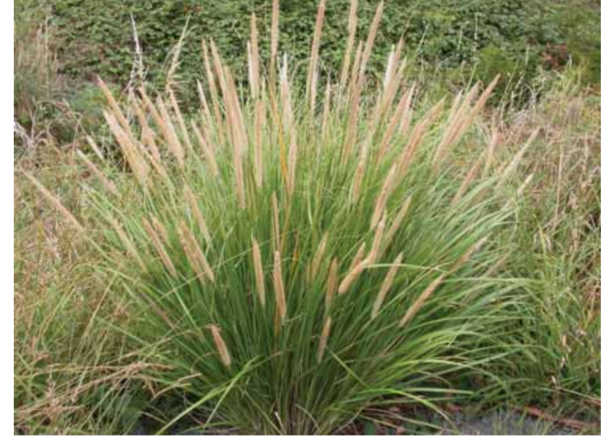
African feathergrass ( Pennisetum macrourum ) is mainly a weed of riparian areas and pastures.

Where large infestations of Pennisetum species occur in native vegetation a planned, strategic approach is essential to ensure that the weed is replaced by