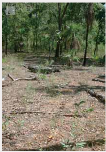
Experimental plots in April 2007, two wet seasons after treatment illustrating from left to right: a) a non-invaded species-rich native plant understorey; b) the dense establishment of the native annual grass ( Pseudopogonatherum irritans ) in plots sprayed in the late wet season (note unsprayed perennial mission grass ( Pennisetum polystachion ) flowering in the background); and c) the sparse establishment of annual cover in plots sprayed in the early wet season.