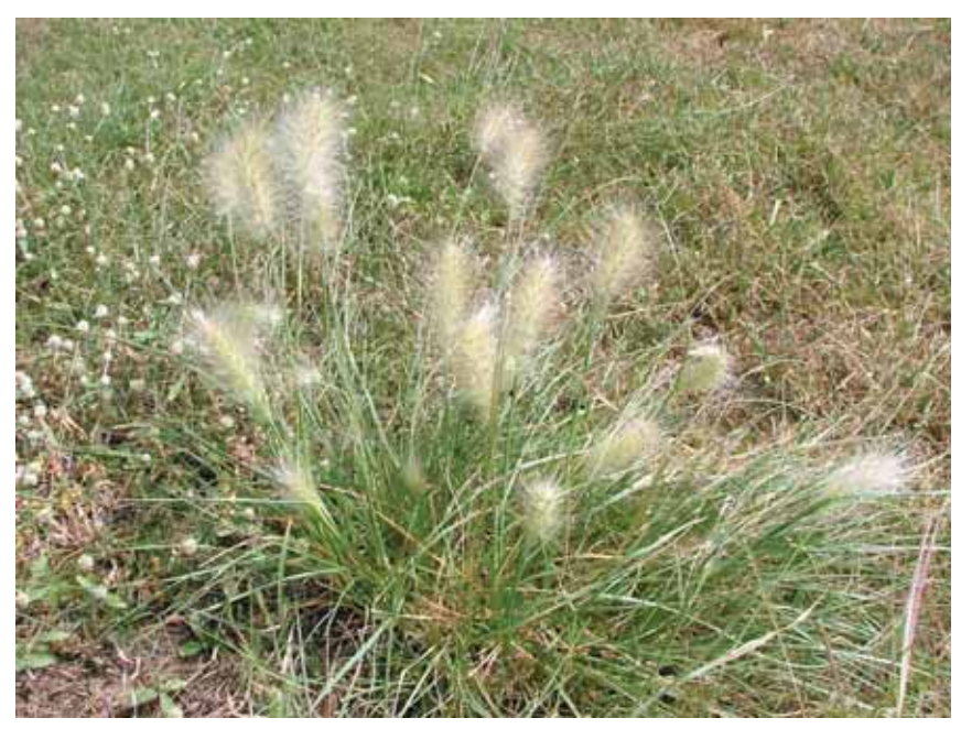
Feathertop ( Pennisetum villosum ) has short rhizomes and commonly spreads along roadsides. It is unpalatable and can infest pastures. It is often confused with fountain grass.

Fountain grass and swamp foxtail are commonly grown in gardens and used in landscape plantings, as are various pennisetum cultivars. Plants and seeds in dumped garden waste can lead to infestations. Mission grasses can be spread through use of contaminated mulch hay in northern Australia.