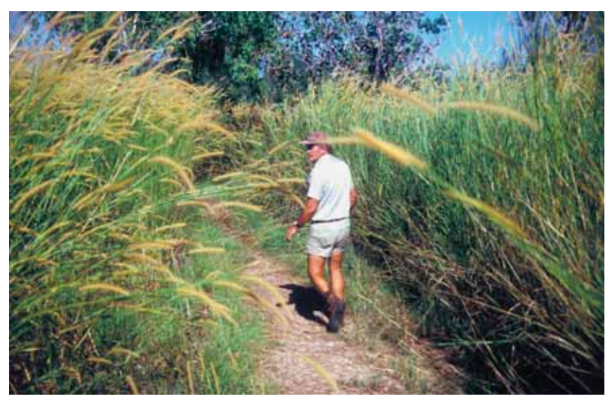
Mission grass ( Pennisetum polystachion ) infestation: Top End NT.

Climate mapping indicates that there is considerable potential for spread of most Pennisetum species into regions where they do not currently occur. Mission grass is well established in the Top End of the NT and in parts of Old,