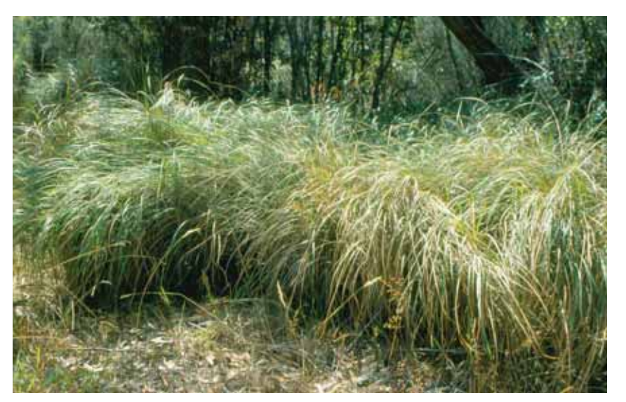
African feathergrass ( Pennisetum macrourum ) infestation.

Most Pennisetum species have received relatively little attention in weed research in Australia and their ecology and impacts are not well documented. A lack of such information limits the accuracy of weed risk assessment for particular species and regions. Effective techniques for broad-scale management of introduced grasses to conserve native ecosystems are needed, especially in northern Australia.