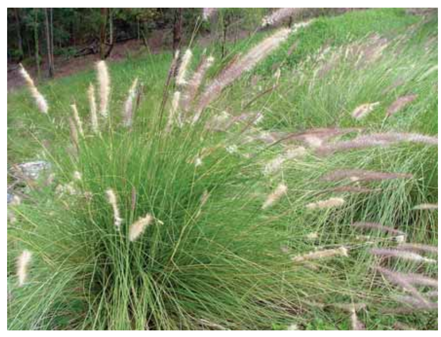
Fountain grass (Pennisetum setaceum) flowerheads are purple becoming straw coloured.

compared with areas where weeds are dominant. Where weedy Pennisetum species infest a pasture, consult local weed control authorities for more detailed advice. No biological control agents have been identified for Pennisetum species.