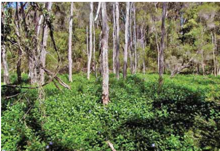
Blue periwinkle ( Vinca major ) can form a carpet in native vegetation, NSW.