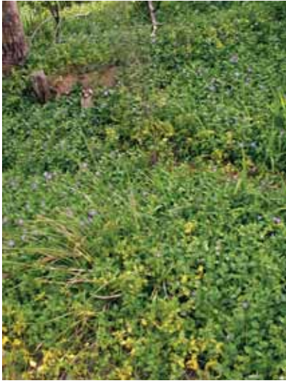
Periwinkle ( Vinca major ) grows entangled with native understorey plants as well as other weeds, making its removal difficult.