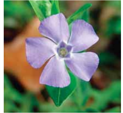
Lesser or common periwinkle ( Vinca minor ) flowers are 2.5–3 cm across. These are smaller than V. major flowers.

spread from runners and generally occurs in open conditions in sclerophyll forest and grassy woodlands. Its native range is New South Wales, Queensland, South Australia and Victoria.