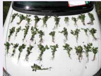
Periwinkle ( Vinca major ) seedlings from one square metre following primary weeding. Snowy River Rainforest, East Gippsland, Victoria.

Restoration of these warm temperate rainforest stands requires patience and careful observation of weed ecology to match the rate of recovery to the pace of works. In particular, seaberry saltbush ( Rhagodia candolleana ), a