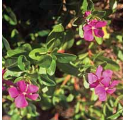
Madagascar periwinkle ( Catharanthus roseus ) is a weed of northern Australian coastal areas, related to blue periwinkle.

Victoria. Its spread appears to be largely vegetative and it may be a local weed problem.