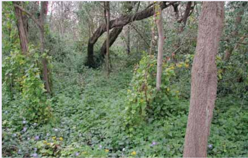
Cape ivy ( Delairea odorata ), tradescantia ( Tradescantia fluminensis ) and periwinkle ( Vinca major ) compete with native species in mature Littoral Rainforest. Second Island, Marlo Estuary, Victoria.

Funding was received from the Australian Government's Natural Heritage Trust to assist Moogji Aboriginal Council, Marlo Coast Action / Coast Care and Parks Victoria to undertake weed control to conserve these nationally significant rainforest stands on First and Second Islands. The first phase in 2005 involved four people working over 6 months, initially treating periwinkle and tradescantia with