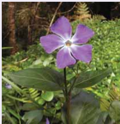
Flowers are 3–4 cm across and leaves are heart shaped, glossy and in opposite pairs.