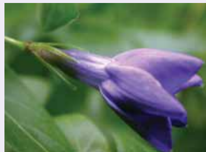
Petals are fused into a tube at the base.